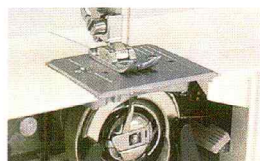
DROP FEED LEVER