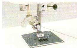
F.A.S.T. NEEDLE THREADING SYSTEM (XL-5500/5600/5700)