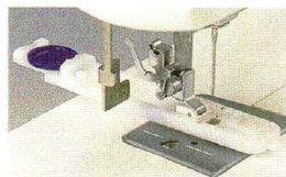
1-STEP "AUTO-SIZE" BUTTONHOLER