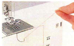
FAST START BOBBIN (XL-5700)